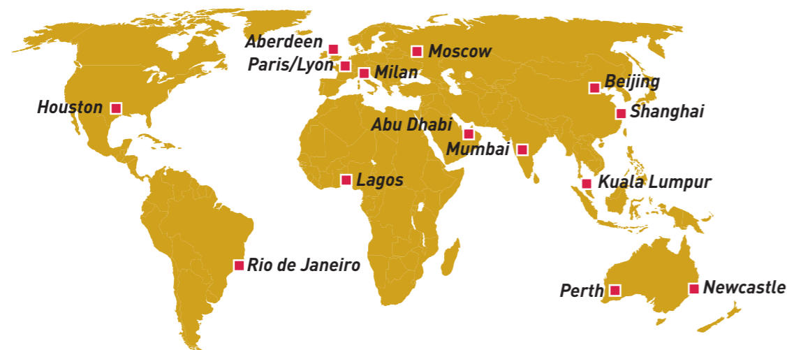
Bureau Veritas worldwide technical center network

Beyond conformity, Bureau Veritas can guide your organization through compliance as a management tool to achieve business continuity and excellence.